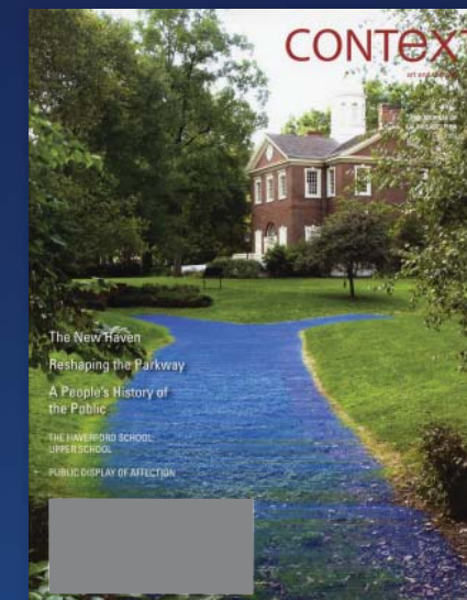
Exhibit at University of Pennsylvania Kroiz Gallery of the Architectural Archives; 2011